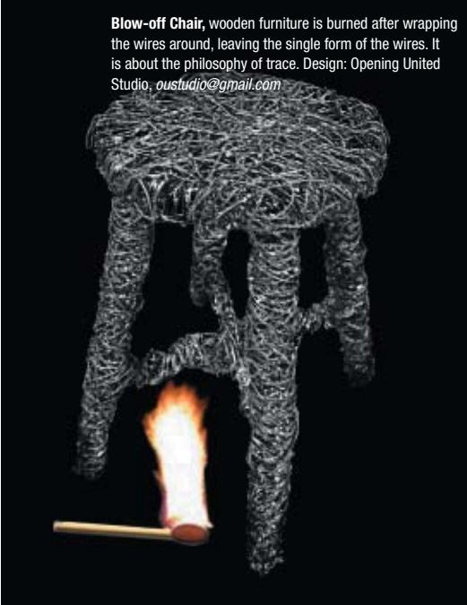
Blow-off Chair , wooden furniture is burned after wrapping the wires around, leaving the single form of the wires. It is about the philosophy of trace. Design: Opening United Studio, oustudio@gmail.com