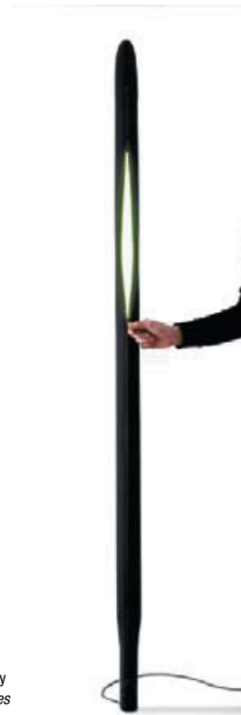
Stripped Light , is a floor lamp inspired by a standard table lamp. Stripped of its lampshade it spends a crystal clear light, while at the same time spreading an atmosphere of subtle comfort. Switched off it reveals its natural interior details. Design: Tina Roeder www.tinaroeder.com