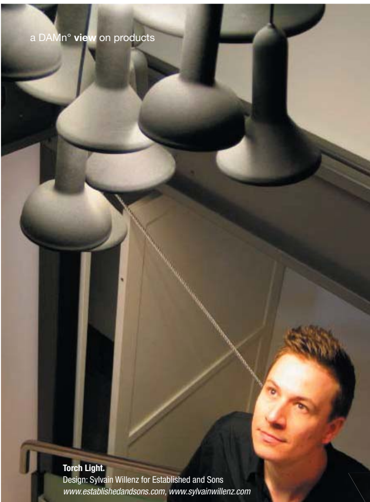
a DAMn° view on products