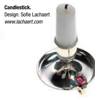
Candlestick. Design: Sofie Lachaert www.lachaert.com