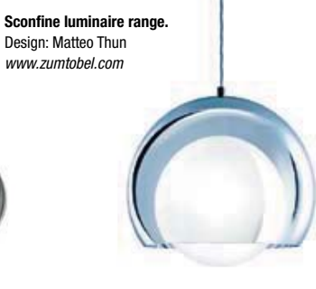
Sconfine luminaire range. Design: Matteo Thun www.zumtobel.com