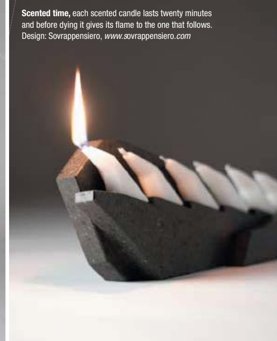
Scented time , each scented candle lasts twenty minutes and before dying it gives its flame to the one that follows. Design: Sovrappensiero, www.sovrappensiero.com